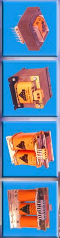
GUARANTEE FIGURE FOR SHELL CONTROL TYPE TRANSFORMER FROM 36 TO 5000 VA